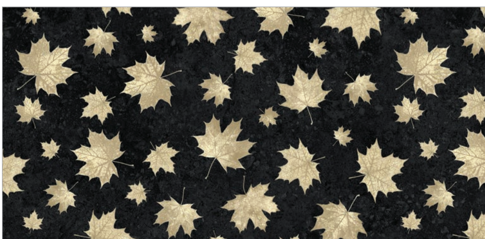
24269-99 | Small Leaves | Black Beige