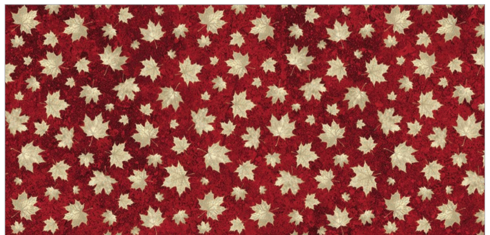
24270-24 | Mini Leaves | Red Beige