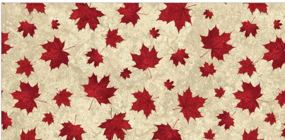
24269-14 | Small Leaves | Beige Red