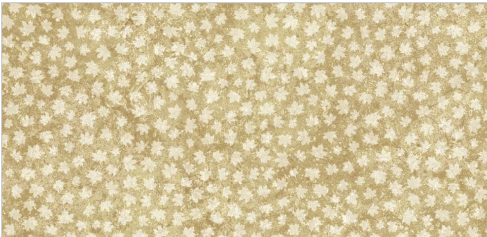
24272-14 | Maple Leaf Blender New | Beige