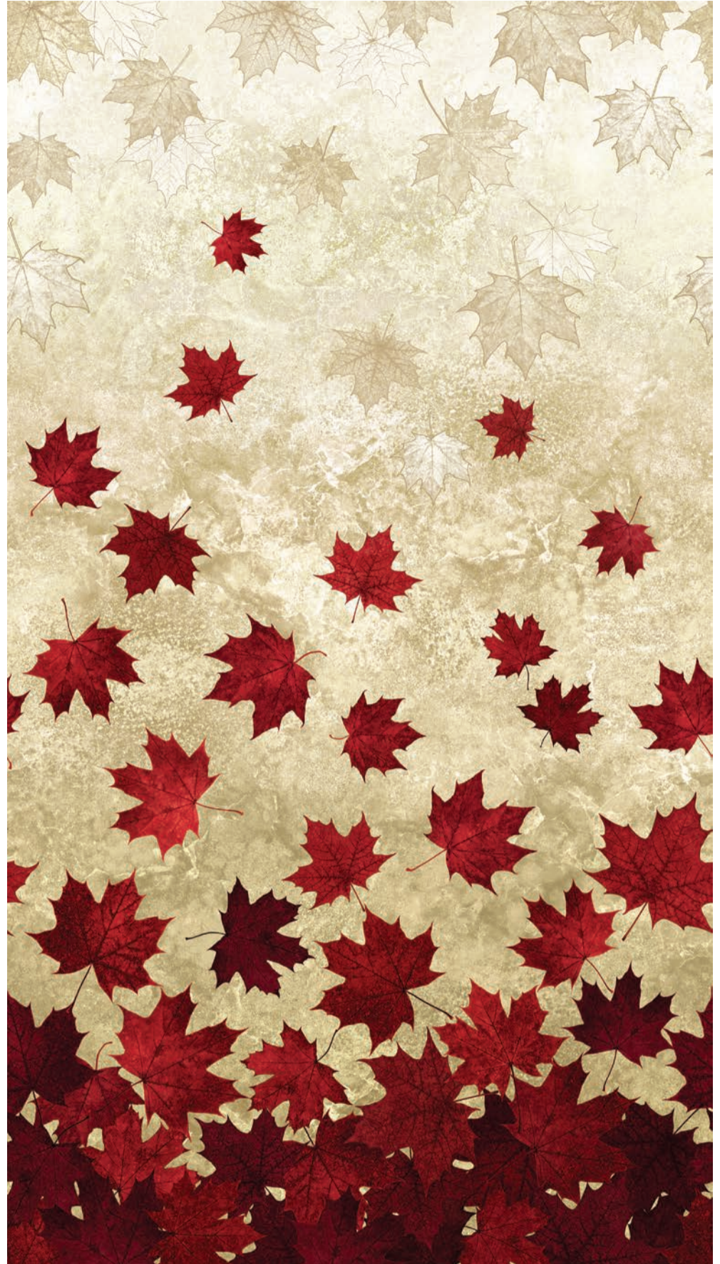
24264-14 | Ombre | Beige Multi