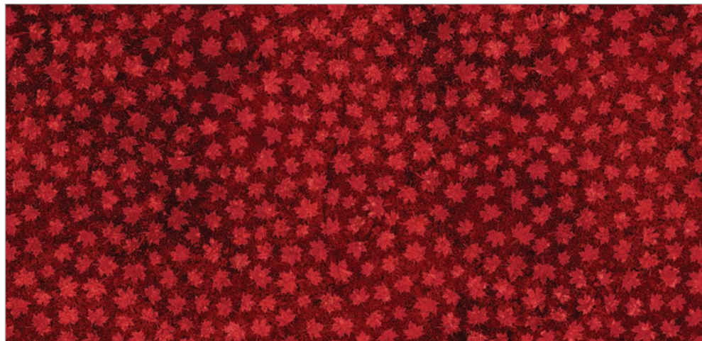
24272-24 | Maple Leaf Blender New | Red