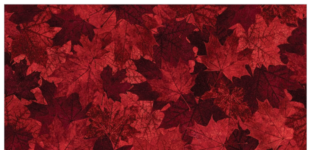
24268-24 | Packed Leaves | Red