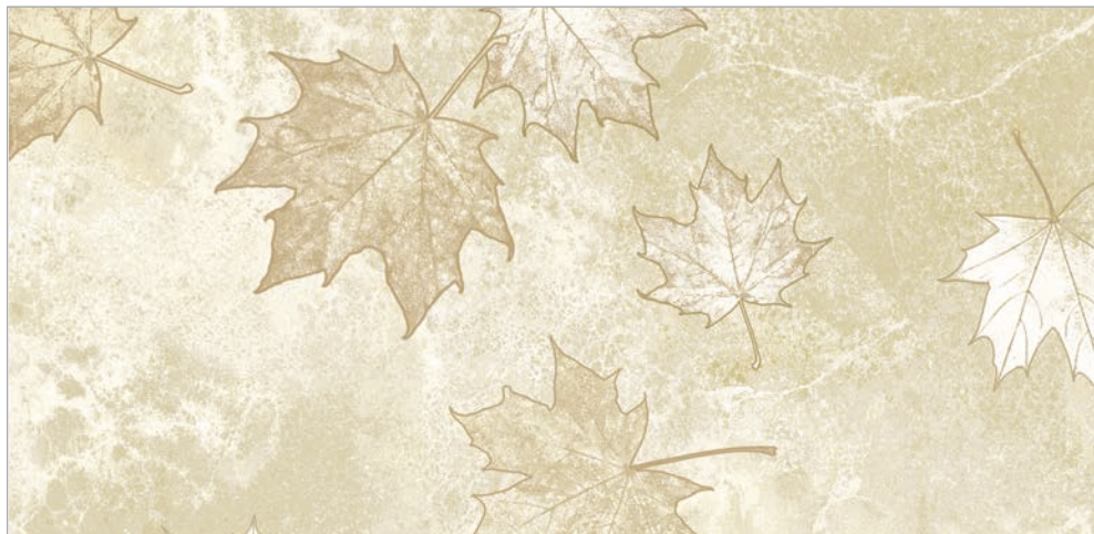
B24267-12 | Leaves Silhouette Wide Backing | Cream Beige