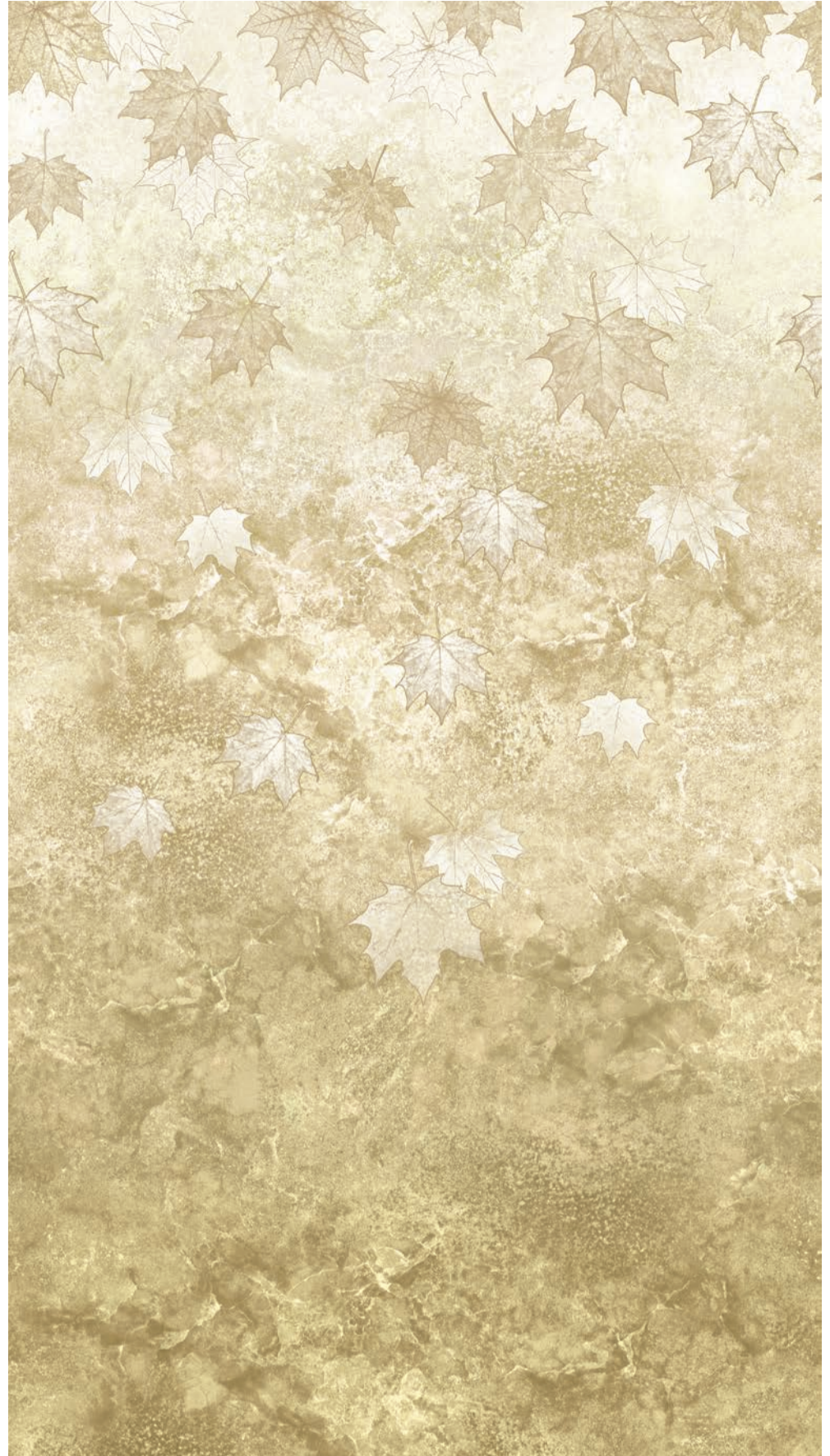
24271-12 | Tonal Ombre | Cream Multi