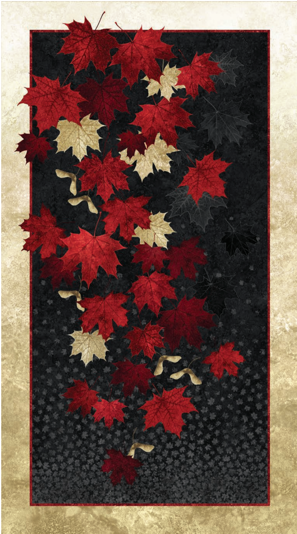
24263-99 | Oh Canada Panel | Black Multi