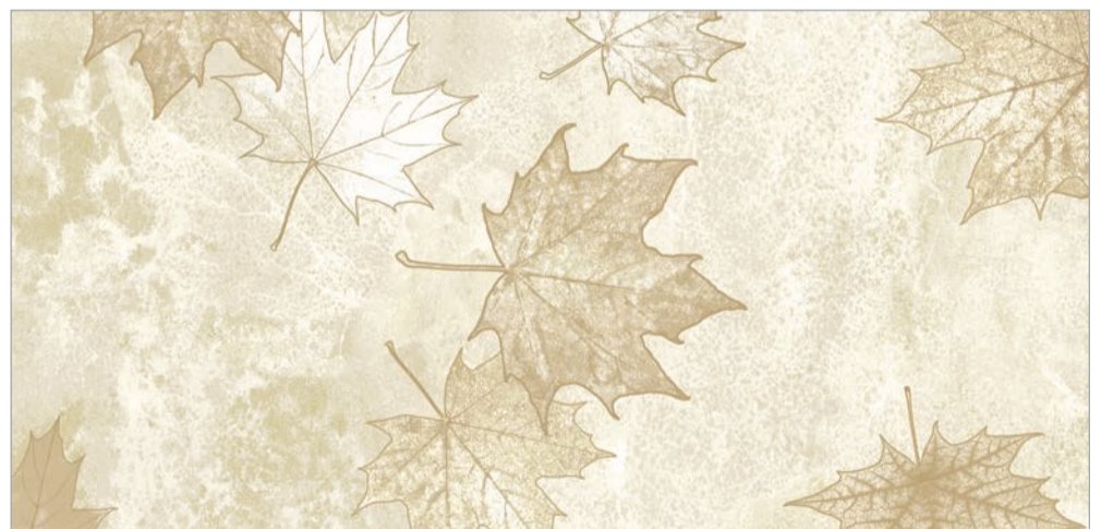
24267-12 | Leaves Silhouette | Cream Beige