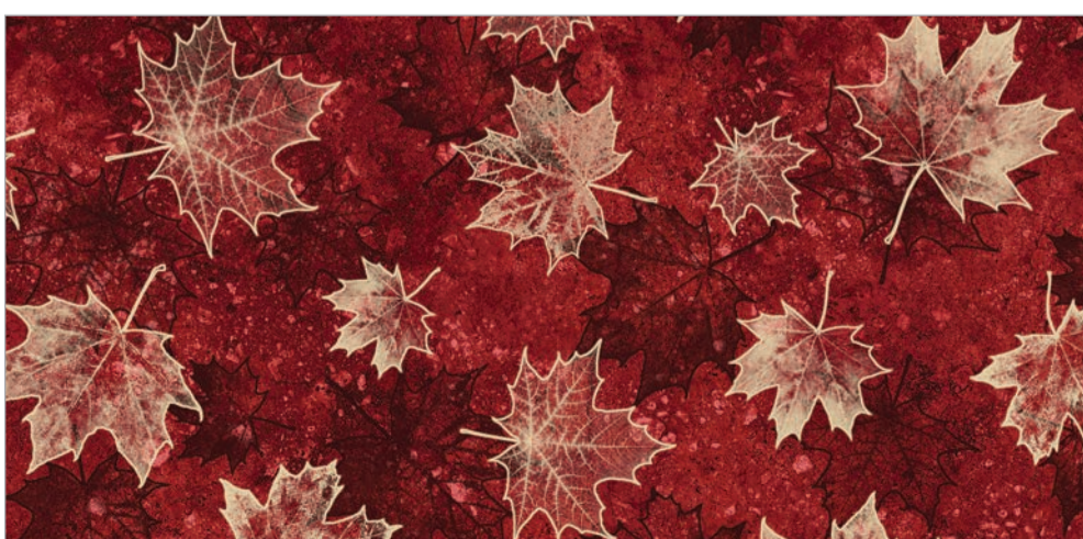
24266-24 | Large Leaves | Red Cream