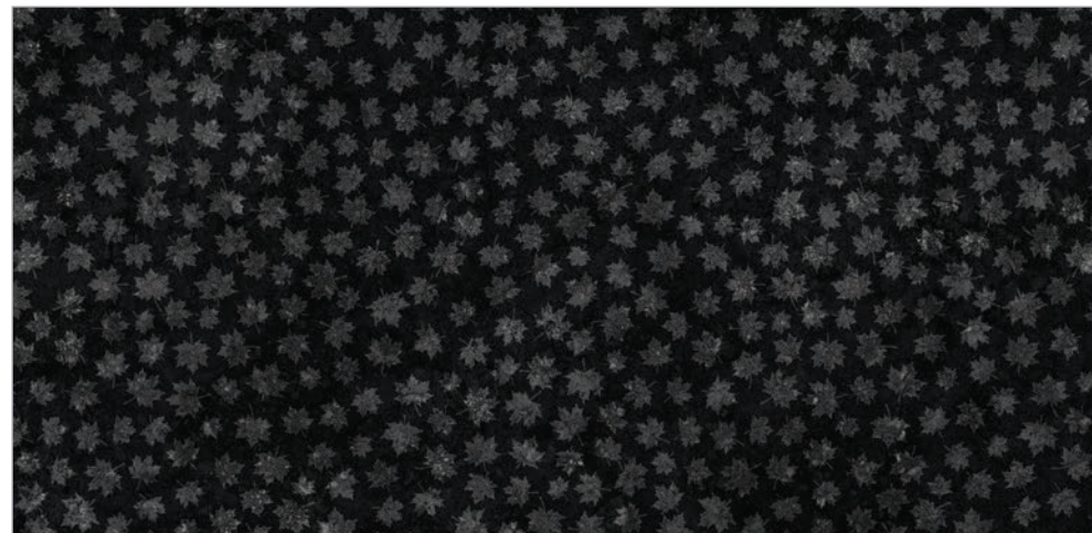
24272-99 | Maple Leaf Blender New | Black