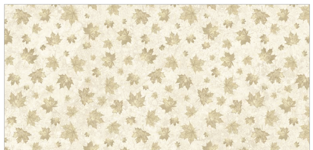
24270-12 | Mini Leaves | Cream Beige