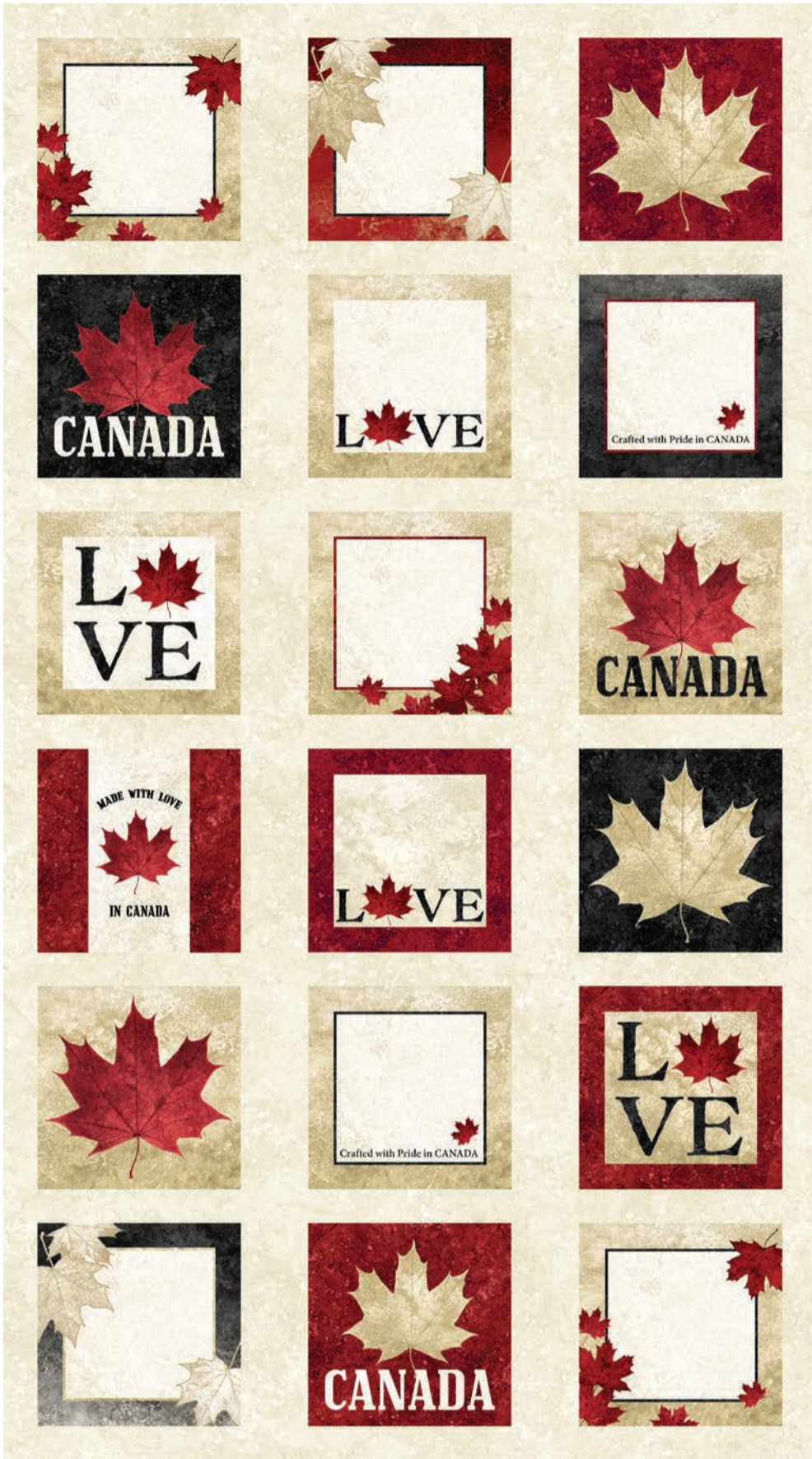
24265-14 | Label Panel | Beige Multi